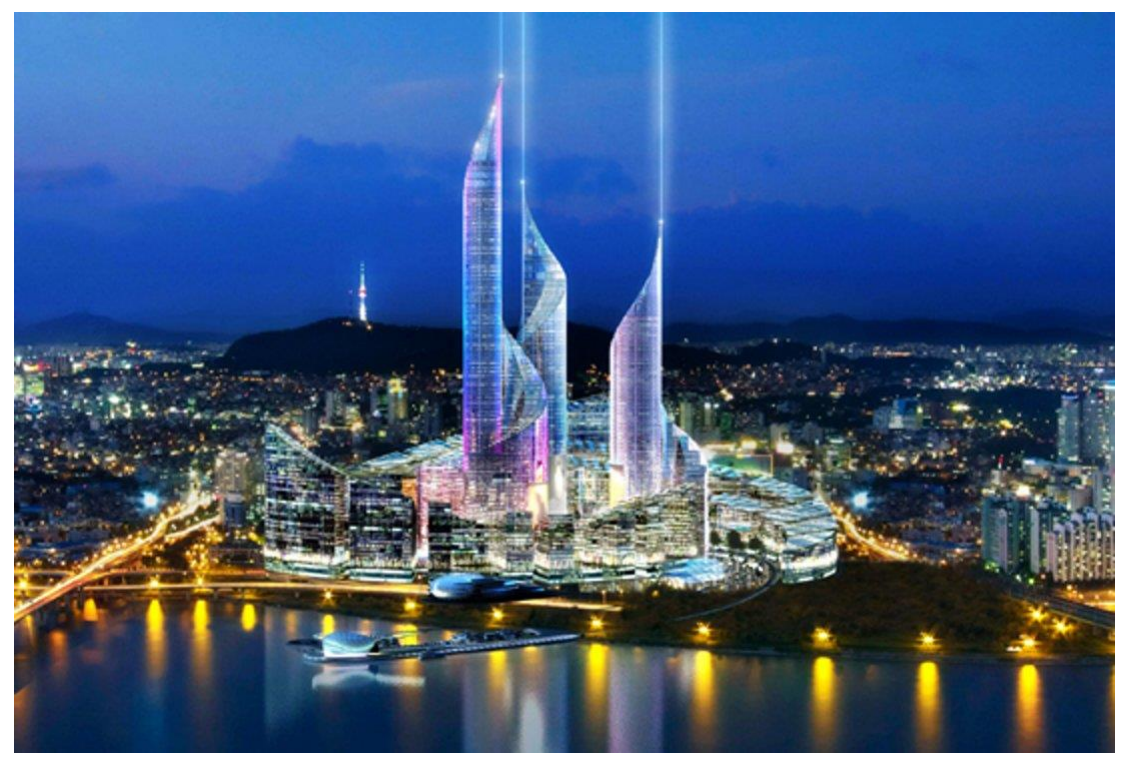
Today, South Korea is densely populated and its economy is growing as it is known for producing high-tech industrial goods.

The following is a list of ten things to know about the country of South Korea: